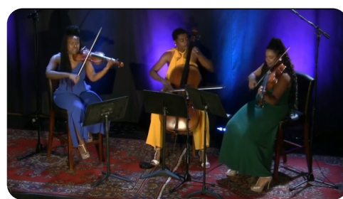
The String Queens