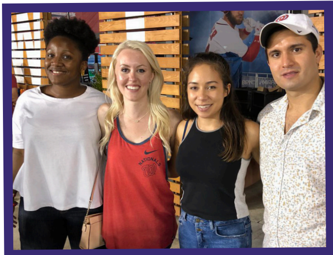
St. Ann's Young Professionals cheer for the Washington Nationals.

St. Ann's Young Professionals Network was created to bring together young people in the DC area who are interested in helping St. Ann's fulfill its mission to strengthen and support families on their journey toward stability.