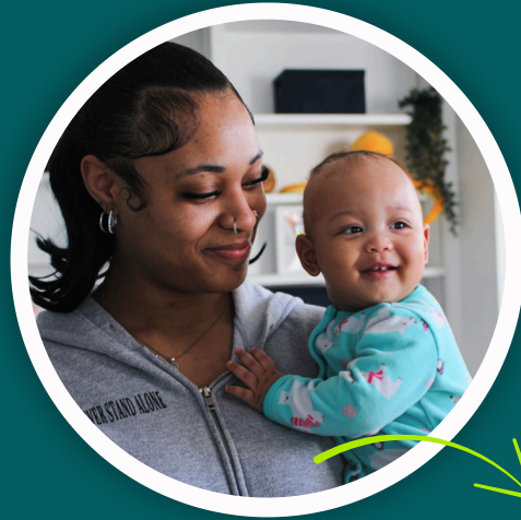
Princess and Jaziah