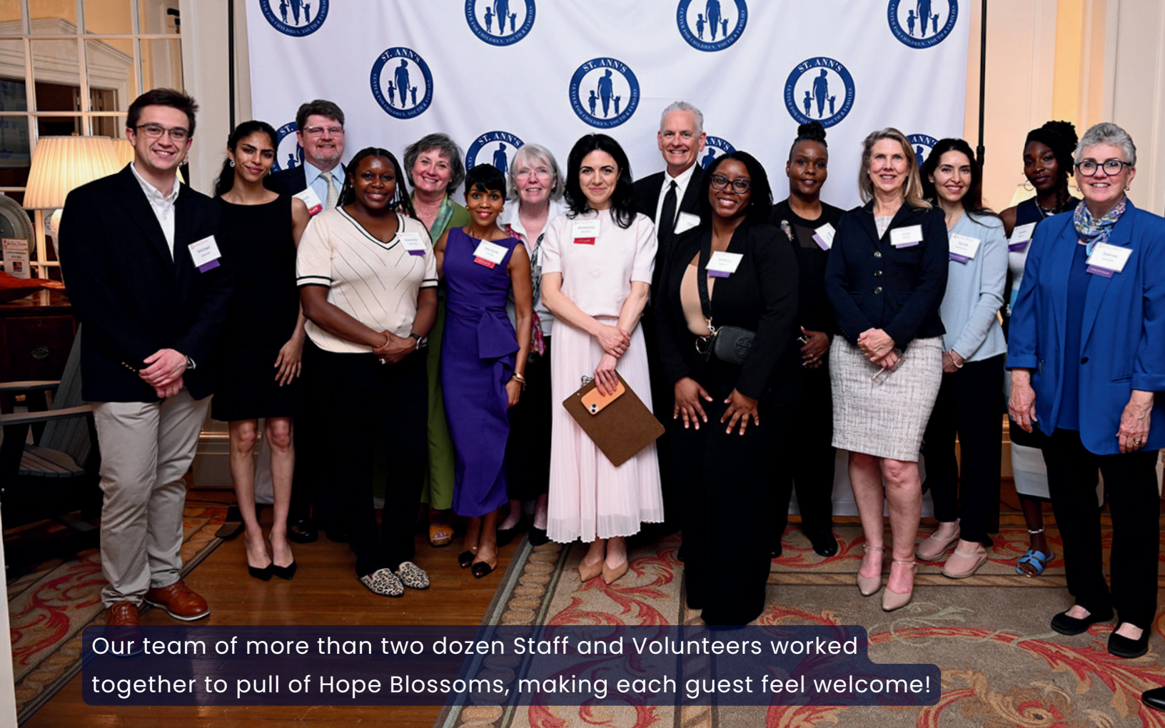
Our team of more than two dozen Staff and Volunteers worked together to pull off Hope Blossoms, making each guest feel welcome!